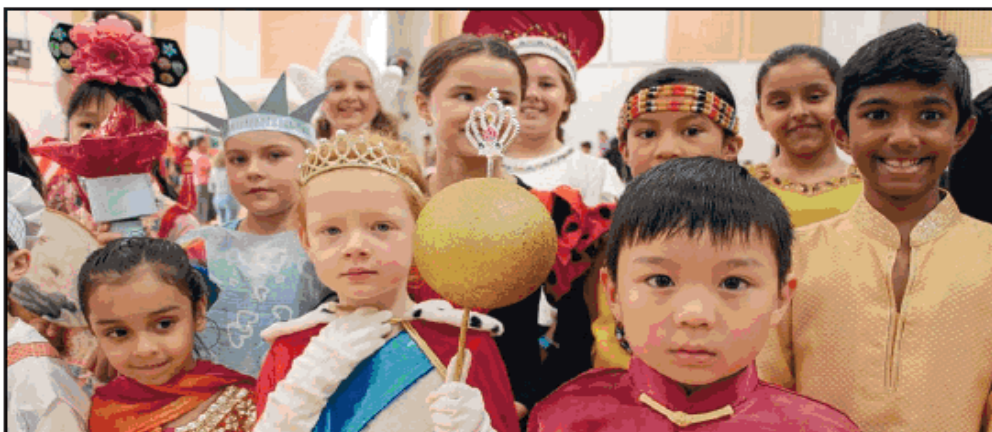
Our Lady of the Pines Donvale students all dressed up for multicultural day.

A SURVEY before a Donvale primary school's multicultural day revealed the students represented an incredible 52 nationalities.